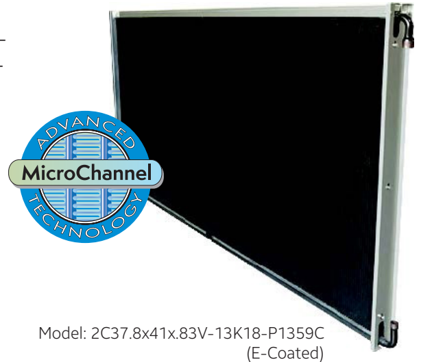
Model: 2C37.8x41x.83V-13K18-P1359C (E-Coated)

* Carrier 30RB and 30XA are registered trademarks of Carrier Corporation.